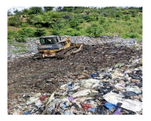
Figure 2. Compacting of waste at the final disposal site in Asankrangwa

This assertion resonates with the claim made by Frank K. Nyame, Tigme J., Kutu M.J., Armah T.K. (2012) that an ineffective municipal waste management system can have detrimental effects on the environment, including the spread of infectious diseases, contamination of the land and water, clogging of drains, and a decline in biodiversity. Furthermore, according to Kabera and Nishimwe (2019), a more sustainable approach to waste management places an emphasis on methods that improve environmental health, such as reduced production, waste classifications, reuse, recycling, and energy recovery, rather than the more typical methods of landfilling and open dumps. According to Bookchin (2007), the concept of social ecological communities aims to enhance how sanitation and waste management affect the physical surroundings in which people coexist peacefully with nature. This entails adopting sustainable methods and appreciating nature's inherent worth.