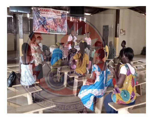
Figure 4. Asankrangwa Youth Recreational programme

The results confirm the Irish Environmental Protection Agency's (1995) assumption that a well-executed civic and environmental project involving all relevant parties will enhance the standard of living for the local populace and further enable the communities to take responsibility for their own environments and means of subsistence. According to Raul et al. (2013), social ecology theory addresses how community involvement and engagement affect the physical environment by addressing social injustices and confronting oppressive structures.