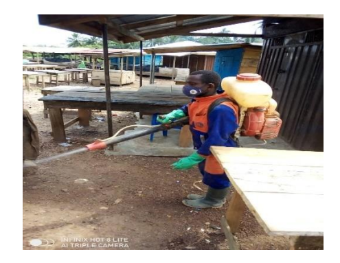
Figure 3: fumigation exercise in Asankrangwa market

This is consistent with Ecology letters (2021) assertion that crowded and unhygienic environmental conditions encourage the spread of disease, and that vector control helps prevent this. Furthermore, for more effective and long-lasting vector control, Anne, Courtenay, Kelly-Hope, Scott, Takken, Torr, and Lindsay (2020) noted that a variety of insecticide- and non-insecticide-based approaches must be used. According to Goldstein, Udiman, Canny, and Dwipartidrisa (2022), vector-borne diseases that arise from waste and are entangled in sophisticated socio-ecological systems are caused by human activities, interactions, decision-making, and social structures with the land they inhabit and alter. According to Lejano and Stokols (2013), social ecology places a strong emphasis on the need of environmental education and consciousness-raising to assist people in understanding ecological issues and taking appropriate action to address them on an individual and community level.