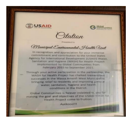
Figure 5. Global Communities citation to Amenfi West environmental health department