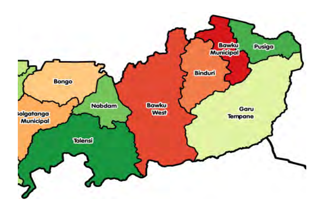
Fig. 1:1 - A map indicating the six districts in Kusaug and