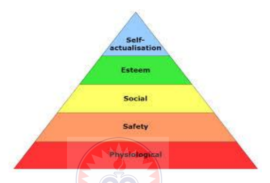
Figure 2.2 Abraham Maslow's needs theory diagram

Maslow argues in his need-hierarchy theory that all humans have universal needs that are satisfied in a hierarchical manner, which is shown in figure 2.2.