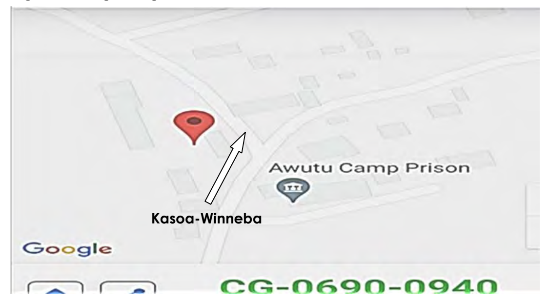
Fig. 1 Geographical map to site of study

The site for the study is Awutu Camp Prison located at Kasoa in the Central Region. Awutu Camp Prison is one of the Forty-Eight prisons in Ghana established in 1982 as one of the camp prisons to decongest the Central prisons with capacity to accommodate 350 prisoners. It is located on a 200-acre land with latitude and longitude coordinates of 5.519540, -0.487992 respectively in the Awutu Senya East District in the Central Region of Ghana. This type of prison mainly houses low risk prisoners. The staff strength of the station is 360 which comprises of 220 male officers and 140 female officers. The station runs a shift system with the morning shift starting from 6:00am to 2pm, the afternoon shift from 2pm to 8pm and the night is from 8pm to 6pm.