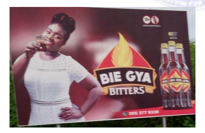
Figure 7 A text from Bie gya advert

We can find new words and phrases formed by compounding which is a very striking feature of advertising language. It is a variety of "lexical units, where each unit is consisting of two or more bases (roots)" (Kvetko, 2001, p. 40) and are called compound words. A compound word may be characterized by its inseparability (it cannot be interrupted by another word), semantic unity, morphological and syntactic functioning and certain phonetically and graphic features (Kvetko, 2001, p. 40). Yule (2017) defines compounding as the process of joining two separate words to produce a single form of word. Compounding was found to be another way of text representation in alcoholic drink advertising. An example is 'Bie gya' in Figure 6.