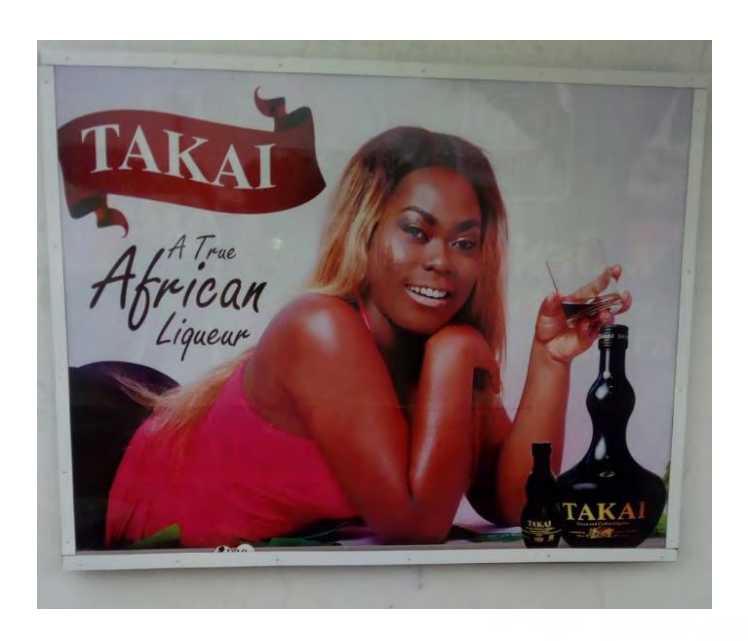
Figure 4 A text from Takai advert

Similarly, the text alomo is another example of borrowing. Alomo from the advert in Figure 4 is a word from Akan precisely Asante Twi which denotatively means a woman you love and cherish so much. Speakers of Asante Twi claim that the texts 'm'alomo' means 'my