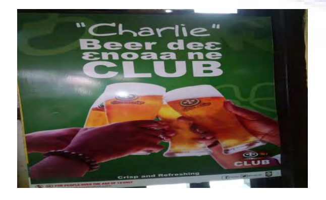
Figure 12 A text from Club Beer advert

Another advertisement which has code-mixing in its text is that of Club beer which is 'Charlie beer dee enoaa ne club' in Figure 11.