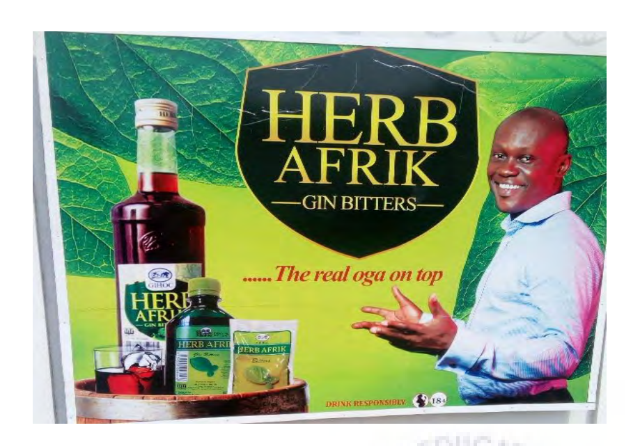
Figure 3 A text from Herb Afrik advert

from Igbo language of Nigeria, which literally means a master or someone of higher social standing. So, to use the text 'Oga' for a drink helps project consumers as masters. Readers and viewers also see themselves as belonging to a certain social class which in turn, prompts them to see themselves as a people of a certain class within the society. In other words, the whole text 'the real oga on top' denotatively means that those who can afford this particular drink are the rich. However, in the connotative sense, they are the bosses within the society. This confirms McDonald (1992) who emphasizes that advertising, principally brand-name advertising, seems predicted on the notion that the public will attach higher status to products that have been brought to their attention by the media.