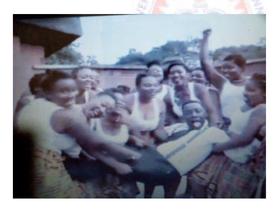
Figure 1 'Adonko' advertising video snapshot

Denotative is the first, inherent, literary meaning. This is first order signification. What we discern in our mind when we heard a word is denotative meaning. In other words, denotative meaning describes the relationship between signifier and signified and the external reality. In terms of visual image, a photograph is a sign, in other words it is a text. As for the example of photograph, denotative meaning is what is photographed and connotative meaning is how it is photographed. Every word has got one denotative meaning but it has more than one connotative meaning. According to Goddard (1998) denotation meaning "is the literal, dictionary definition of a word, it is the barest factual meaning" (Goddard, 1998, p. 125). These meanings are exemplified perfectly with the Figure 1.