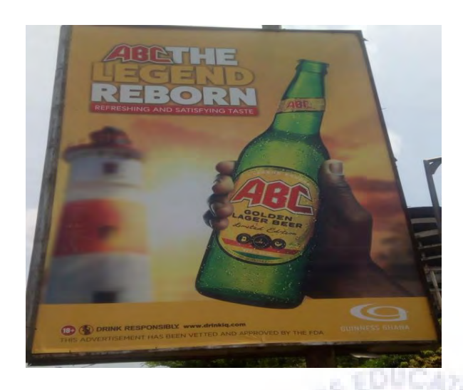
Figure 11 A text from ABC advert

G.P.R.T.U, GTV and GBC. Therefore, the text 'ABC' used by the advertisers was meant to depict initialization and alphabetism. From the producers, the text as a brand name is to aid the