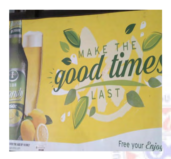
Figure 13 A text from Shandy advert

of the drink. Another alcoholic advertisement text is 'Mood' which communicates to viewers and readers the state of being of the consumer after drinking the product. Based on these, Atkins (1993) observes that people find beer commercials more visually appealing than public service announcements.