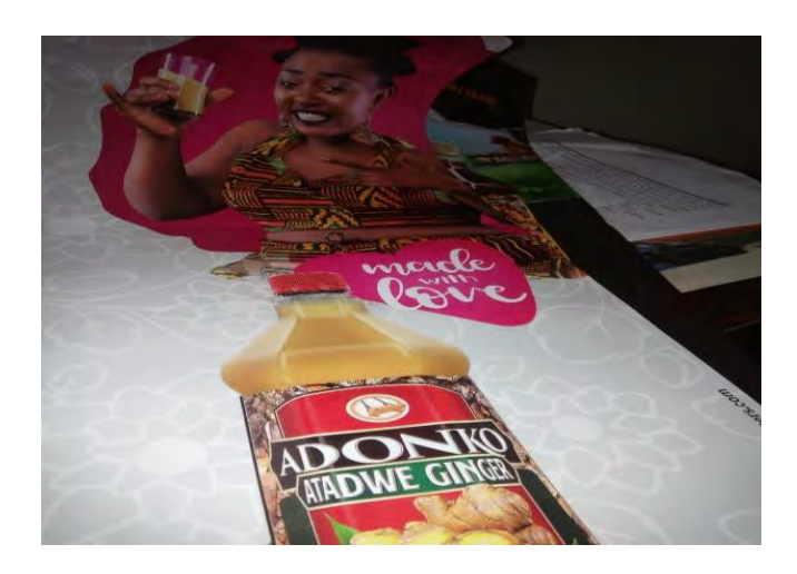
Figure 14 A text from Adonko Atadwe Ginger advert

you take the drink or you will be filled with love after taking it. However, to the manufacturers, the drink tastes like the raw tiger-nuts. The text on the drink also projects romantic love. This is affirmed by Van Leeween (2003), who argues that all discourse inherently as texts devoid of explicitly visual features will utilize a specific style of handwriting and be arranged in a particular way on a page. However, the text 'made with love' with a love sign symbolically has other implied meanings such as either the drink is good for love making or it may be good for lovers, or for a group of people who love one another. On the other hand, it may also mean that the drink is taken purposely for someone who wants to make love with another. This confirms Rogers and Asker's (1992) findings that alcoholic advertisements evoke acceptance by spreading brand awareness amongst the audience about the product and how to increase their interest.