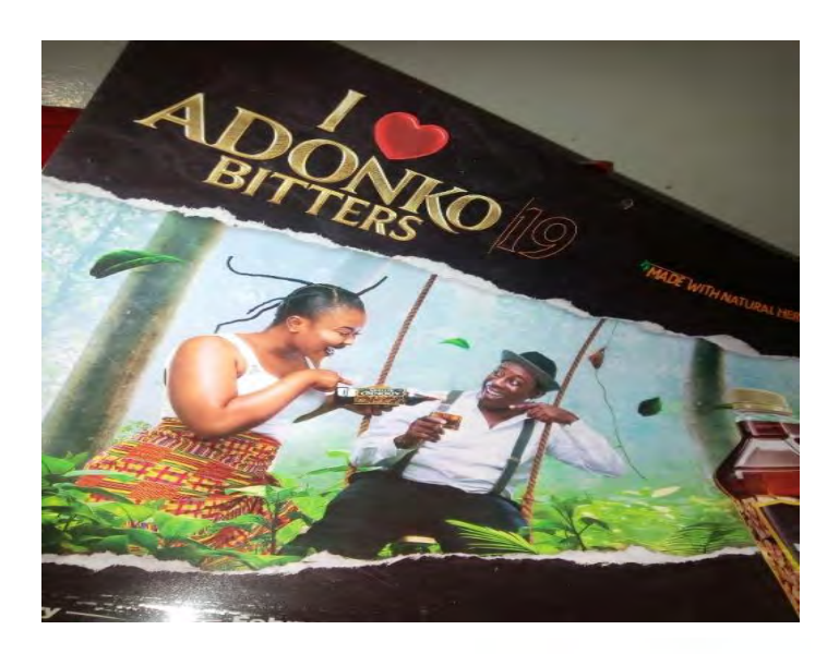
Figure 2 A text from the Adonko advert

In other words, 'Adonko' in connotative sense means that when a person takes the drink, it can induce him to swing a woman on bed, bearing in mind the fact that the drink contains the same effects as the seesaw children play on. Nath (1986) supports this view and states that effective advertising is concerned with the effects of the campaign on its audience. Therefore, the whole text, 'I love Adonko Bitters' in Figure 1 seeks to express the real love people will develop for the drink. It also means the feeling or the perception of the people based on the meaning or idea of the 'seasaw' that is able to take the occupier anywhere when it is swung.