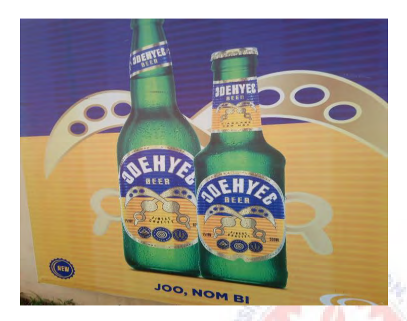
Figure 6 A text from odehyee Beer advert

belong to the royal classily. So using the text to name a drink will make people become or feel prestigious among their peers.