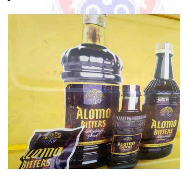
Figure 5 A text from Alomo Bitters advert

Similarly, the text alomo is another example of borrowing. Alomo from the advert in Figure 4 is a word from Akan precisely Asante Twi which denotatively means a woman you love and cherish so much. Speakers of Asante Twi claim that the texts 'm'alomo' means 'my