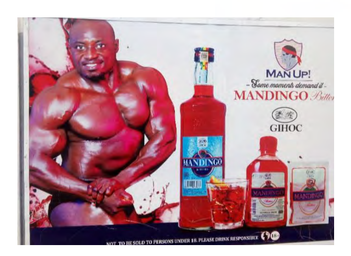
Figure 9 A text from Mandingo advert

The text Mandingo in Figure 8 is also a compound word. According to the manufacturers, 'Mandingo' stands for 'man, in, and go' which have put together. It denotes that 'a man should go and do an unsaid action'. On the other hand, the /d/ between 'Man' and 'in' and 'go' is as a results of the place of articulation /n/ in the text 'Man' having the same place of articulation of /d/ which are alveolar.