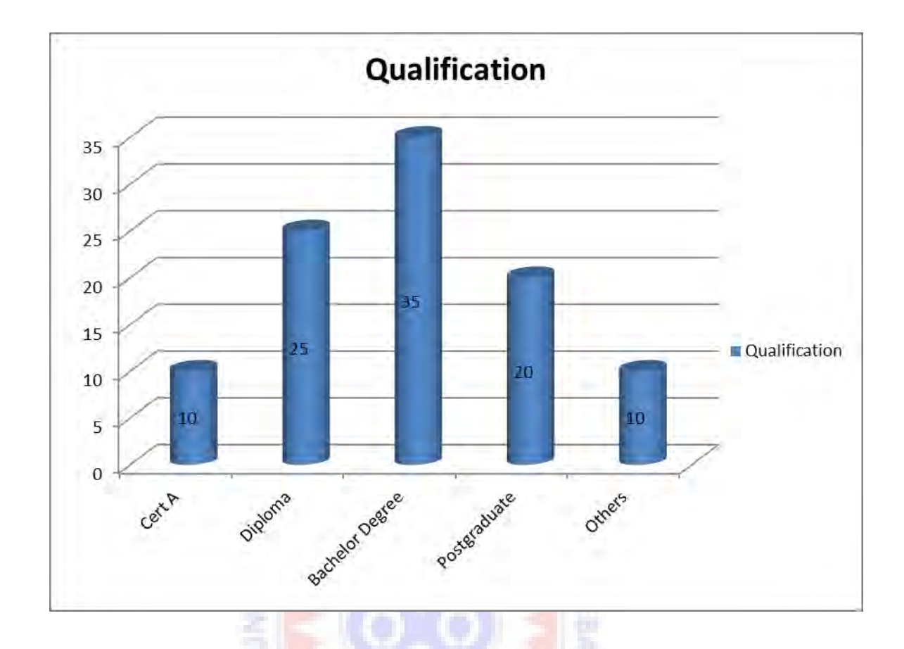
Figure 4.3: Education Qualifications of Respondents

Concerning the various positions of the respondents, the study discovered basically the following, thus circuit supervisors, headteachers and teachers. It was realised that most of them were headteachers who manage the day-to-day running of the school. It was also discovered that few were circuit supervisors who direct and coordinate affairs of the schools in the Yendi community. The teachers were in the majority in the Yendi area. All these positions obviously are necessary to receive professional training in the furtherance of the quality education in the Yendi community.